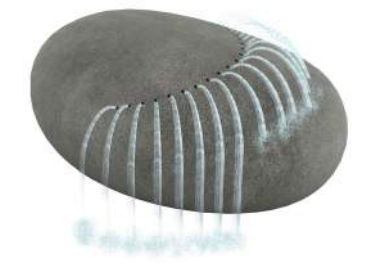
Directional Sprays (Spray Arches)