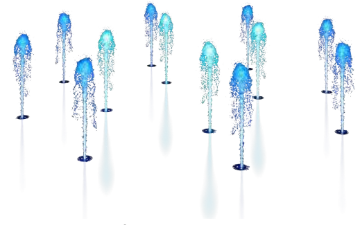
Lumiflow ground sprays (with or without lighting for evening play)