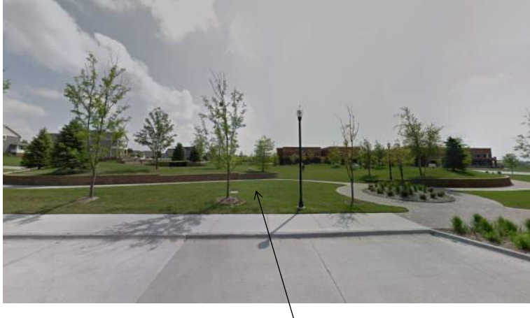
Fallbrook - grade changes/grass berms, pathway accents, integrated landscape areas