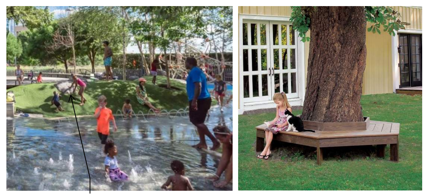
Climbable Turf Berms & Boulders (At Playground and Splashpad)